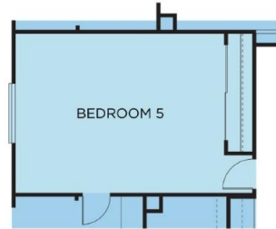
OPT. BEDROOM 5