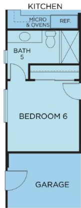
OPT. BEDROOM 6 / BATH 5