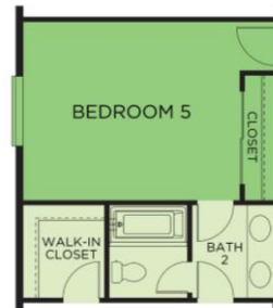
OPT. BEDROOM 5