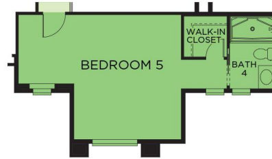
OPT. BEDROOM 5