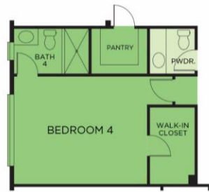
OPT. BEDROOM 4